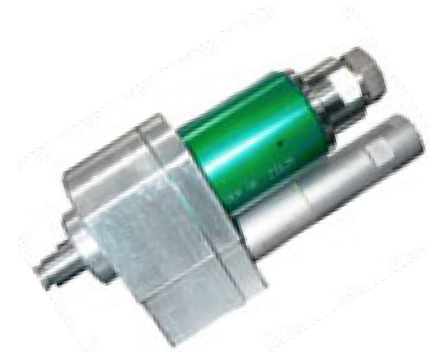
Part No. 7029561