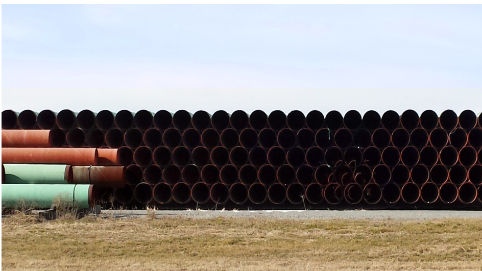
Pipe Waiting to be Tested