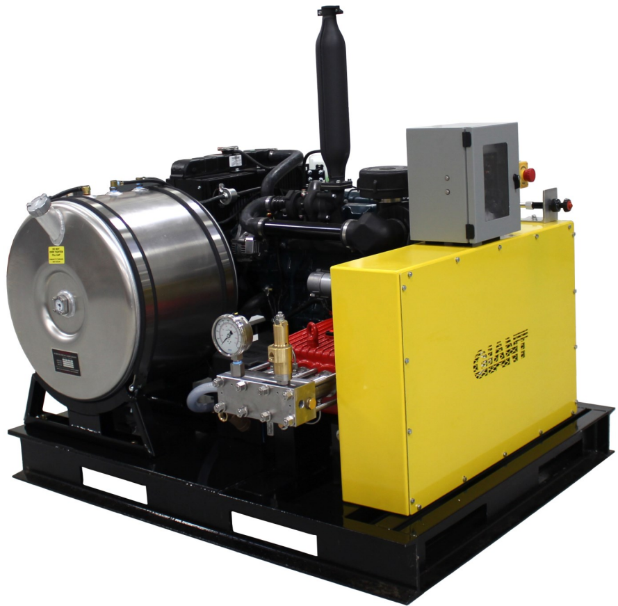
Mobile truck bed unit—up to 15,000 PSI

The portability of this unit makes it usable for a variety of applications. Along with hydrostatic testing of pipeline this unit is also capable of testing valve stations.