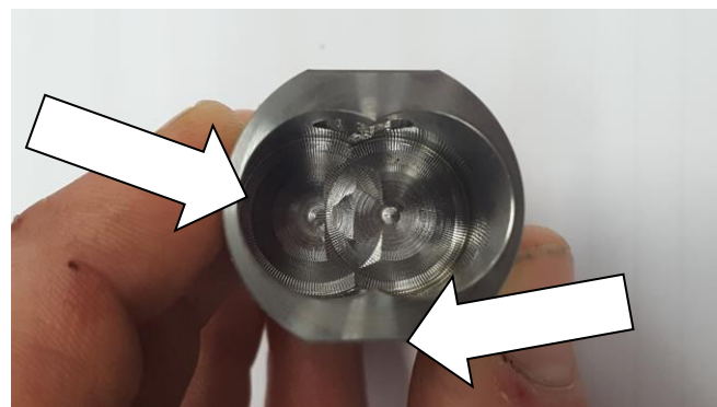
Figure 2: Current Crosshead Design

Previous design with two oil return holes and no milled flats